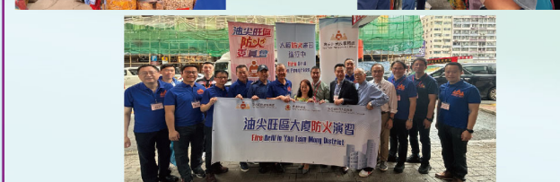
Members of the Yau Tsim Mong District Fire Safety Committee distributed fire prevention leaflets to nearby shops. Representatives from FSD explained to residents on what they need to pay attention to in the case of a fire.