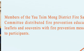
Members of the Yau Tsim Mong District Fire Safety Committee distributed fire prevention education leaflets and souvenirs with fire prevention messages to participants.