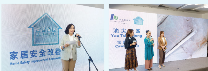
The Home Safety Improvement Community Programme ceremony

In order to improve the living environment of residents in old districts, the Urban Renewal Authority launched a one-year "Home Safety Improvement Community Programme", which was supported by the Yau Tsim Mong District Office, among others. The programme gathered the strength of the District Fire Prevention Committee and local organisations to provide home safety solutions with essential safety and fire protection facilities to the grassroots and underprivileged families, such as elderly, people living in sub-divided units, and ethnic minorities, so as to improve the home safety level of these households. The launch ceremony was held recently, officiated by the Secretary for Home Affairs and Youth Affairs Ms Alice MAK Mei-kuen, SBS, JP.