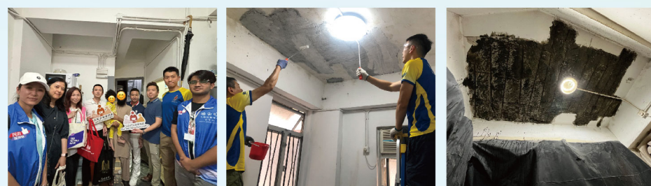
The first trial project on July 26 has been completed successfully.

This project will benefit ten families in need in the West Area of Yau Tsim Mong, and there are plans to share the experience with a larger audience in future.