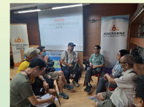
Participants shared their difficulties in handling the fire safety works in their buildings.

Yau Tsim Mong District Office ("YTMDO") continues to implement the Fire Safety Direction Support Service in the district. As at 15 August 2024, staff from the YTMDO have attended 106 OC meetings and 11 MC meetings. The scheme has assisted 205 buildings in hiring consultants and contractors to comply with the fire safety directions, assisted 35 buildings in beginning works according to the approved FSI schematic drawings, helped 8 buildings in complying with the fire safety directions, and assisted 33 "3-nil buildings" in forming OCs. Moreover, YTMDO and MKKFA has organised a "Fire Safety Works Sharing Session" on 21 August; representatives of 25 buildings attended the sharing session to share their experiences on fire safety works. It is hoped that this will enhance the confidence of other target building owners in complying with the fire safety directions and raise owners' awareness of the fire safety improvement works.