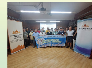
Group photo of participants and staff attending the "Fire Safety Works Sharing Session".