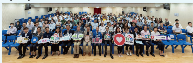
Seminar on "Ensuring Property Safety - Understanding the Mandatory Building and Window Inspection Schemes and Slope Management Work" on 28 August.

The three workshops attracted more than 3,100 participants. Many participants commented that the content of the workshops was very informative and that they were able to manage the buildings more effectively after acquiring the knowledge of building management.